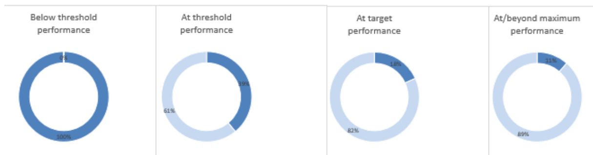
CFO target pay mix 2020 in %

■ Proportion of: fixed pay ■ variable pay